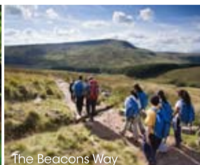
The Beacons Way