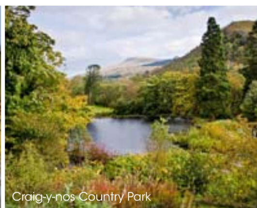
Craig-y-nos Country Park