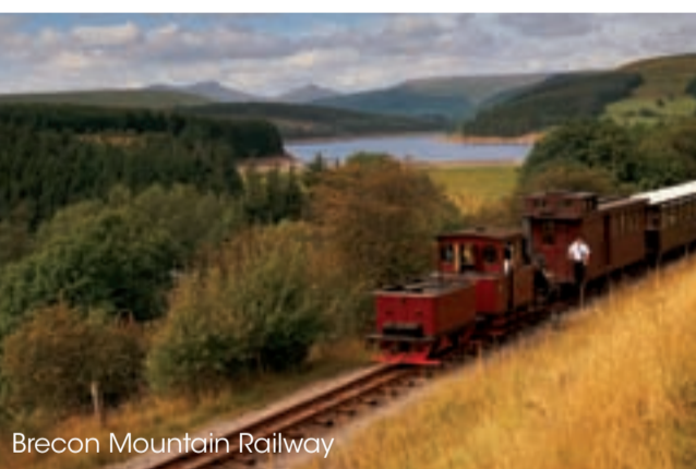
Brecon Mountain Railway