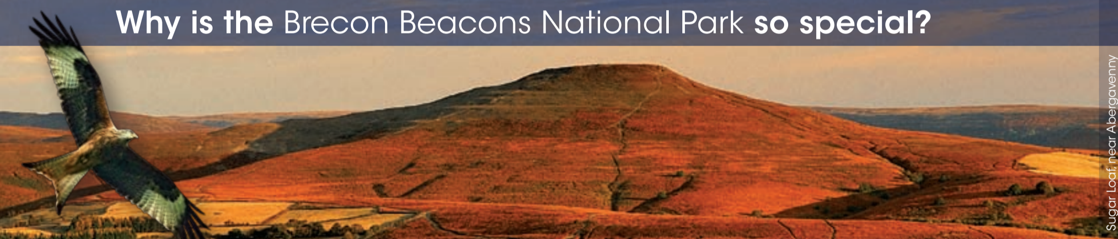
Sugar Loaf, near Abergavenny