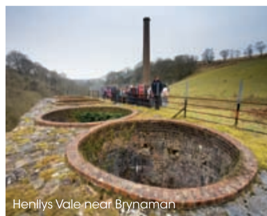
Henllys Vale near Brynaman

This map is based upon Ordnance Survey material with the permission of Ordnance Survey on behalf of the Controller of Her Majesty's Stationery Office © Brecon Beacons NPA, Crown Copyright. Unauthorised reproduction infringes Crown Copyright and may lead to prosecution or civil proceedings. 100019123, 2009. Mapping produced by www.themapsgang.com