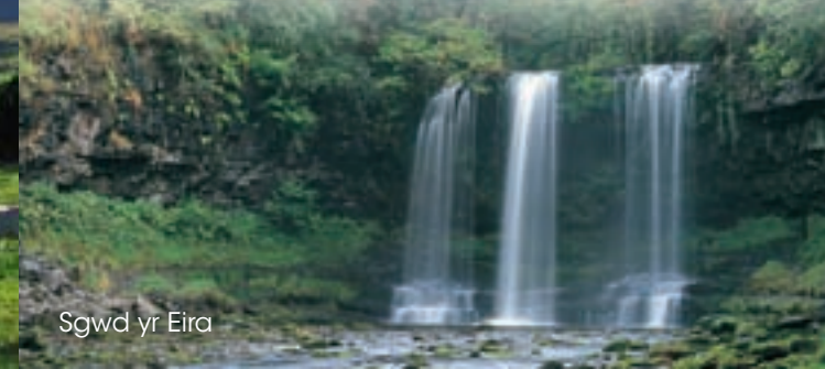
Sgwad yr Eira

Housing an exhibition showing the formation of the waterfalls and uniqueness of the Forest Fawr Geopark, this Centre is an ideal place to start your exploration of Waterfall Country. Choose an audio trail to take on a walk, pick up our new guide to the Gunpowder Works or just breathe in the misty air at the magical Sgwad yr Eira waterfall - an experience never to be forgotten!