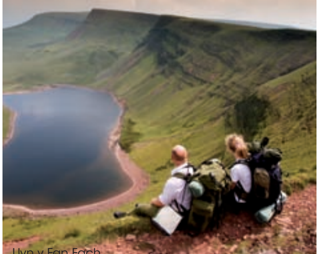
Llyn y Fan Fach

Please don't disturb or feed our wildlife or pick our flowers and plants. Please take plenty of photographs, make drawings and memories.