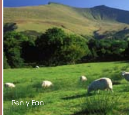
Pen y Fan

You can download the 'Stay Somewhere Green!' booklet from our website or pick up a copy from Information Centres.