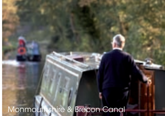
Monmouthshire & Brecon Canal