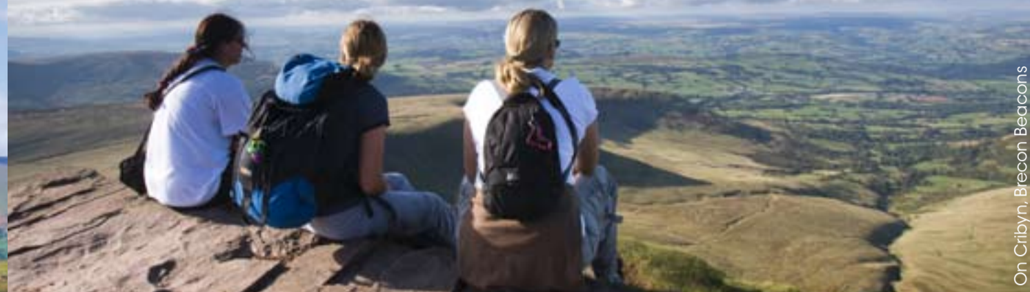
On Cribyn, Brecon Beacons

...to the Brecon Beacons National Park, a unique landscape of Old Red Sandstone peaks, open moorland, green valleys, hidden waterfalls and fern-filled gorges. Explore caves and castles, vibrant villages and an array of events for a truly Welsh experience.