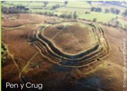
Pen y Crug

The National Park has 268 scheduled ancient monuments spanning 7000 years of human history.