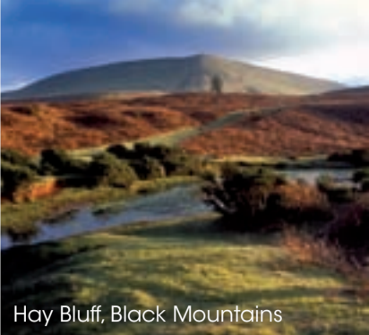
Hay Bluff, Black Mountains